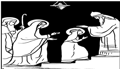
Presentation of the Blessed Virgin Mary

Mass for November 23, 2017 Thanksgiving Day will be held at 8:00 am